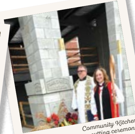
Community Kitchen ribbon cutting ceremony