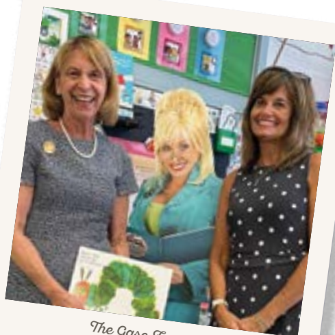
The Gase Family Literacy Fund

Family Learning Center Tiffin YMCA St. Francis Senior Ministries Financial Assistance for Cancer Treatment Geary Family YMCA Flat Rock Home