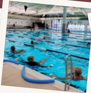
New YMCA pool