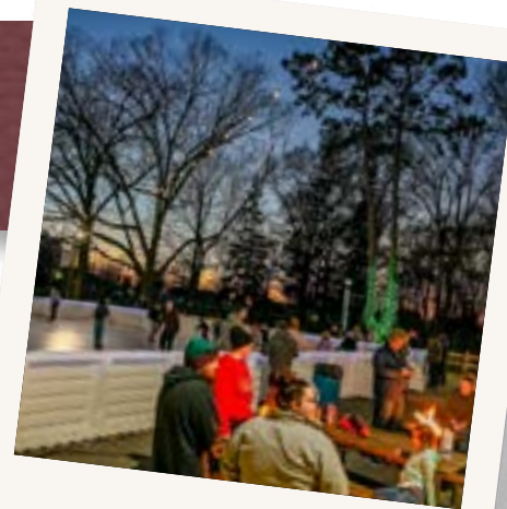
The Sutton Bank Skating Rink

Agency, Designated and Donor Advised Funds are established by individuals who wish to support personal charitable interests and make recommendations for grants from their funds, subject to the approval of The Tiffin Community Foundation Board of Trustees. In 2024, The Tiffin Community Foundation awarded over $930,000 in Agency, Designated and Donor Advised Community Grants.