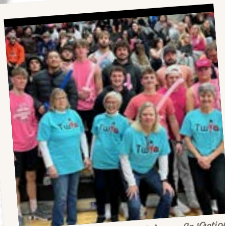
Tuffin Women In Action