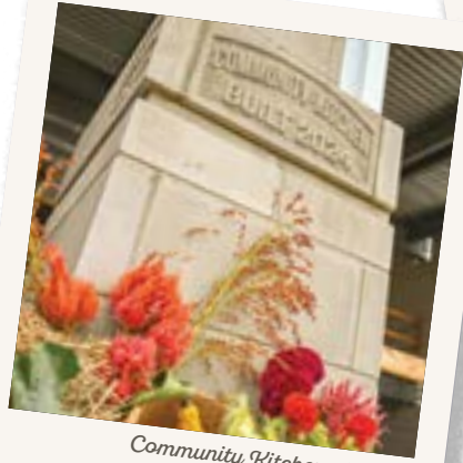
Community Kitchen pillar at ribbon cutting