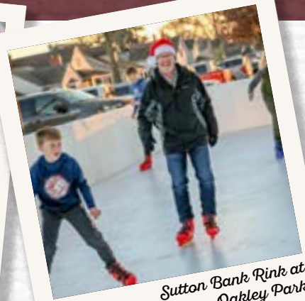
Sutton Bank Rink at Oakley Park