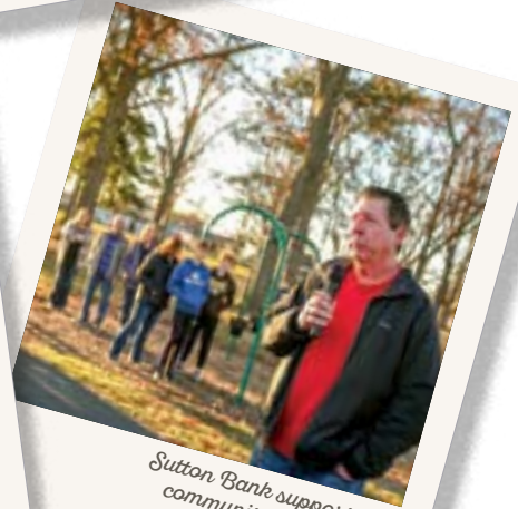
Sutton Bank supports the community skating rink