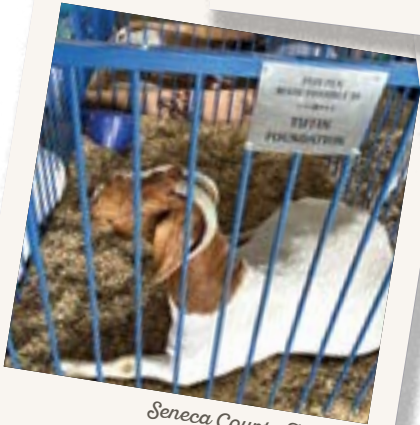
Seneca County Jr. Fair