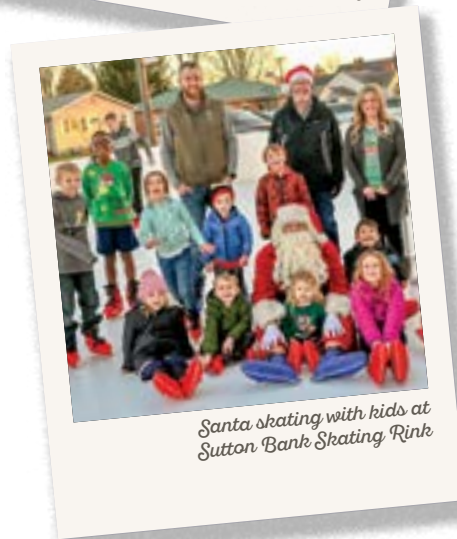
Santa skating with kids at Sutton Bank Skating Rink