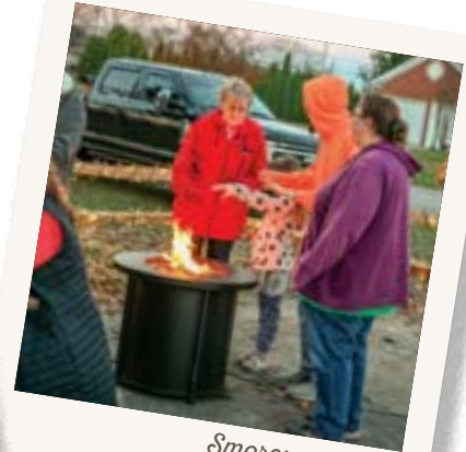
Smores at Sutton Bank Skating Rink