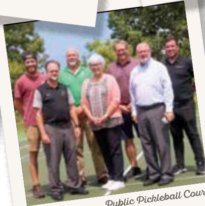
Public Pickleball Court