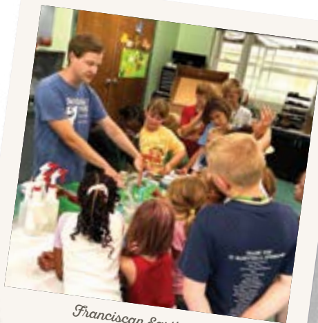
Franciscan Earth Literacy Center