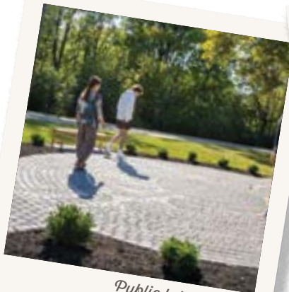
Public labyrinth at Heidelberg University