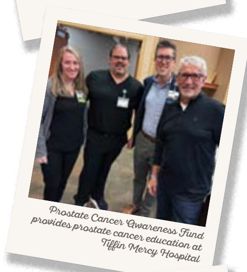
Prostate Cancer Awareness Fund provides prostate cancer education at Tiffin Mercy Hospital