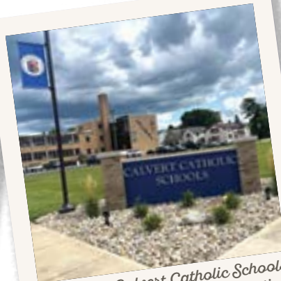
Calvert Catholic Schools beautification