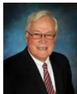
| Neil Jordan